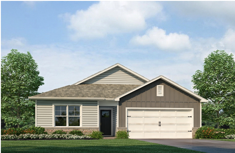
ELEVATION - C (SHOWN WITH OPTIONAL STONE WATER TABLE)