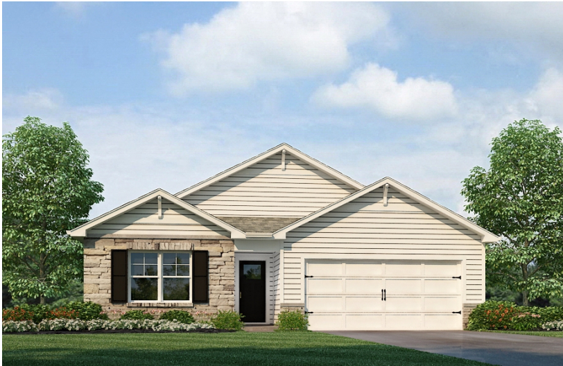
ELEVATION - A (SHOWN WITH OPTIONAL FULL STONE)