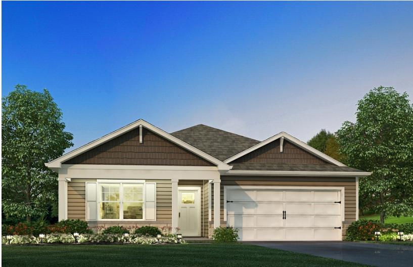
ELEVATION - B (SHOWN WITH OPTIONAL STONEWATER TABLE)