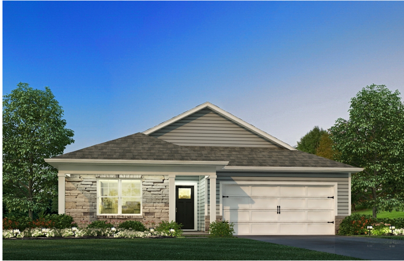
ELEVATION - D (SHOWN WITH OPTIONAL FULL STONE)