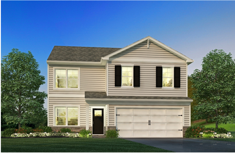
ELEVATION - A (SHOWN WITH OPTIONAL STONE WATERTABLE)