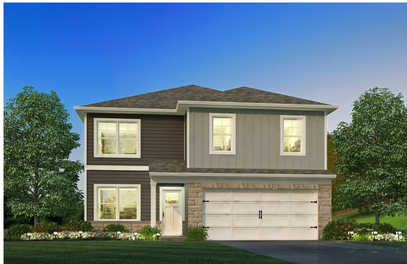
ELEVATION - C (SHOWN WITH OPTIONAL STONE)