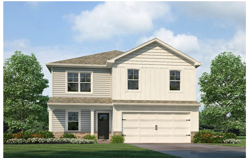
ELEVATION - D (SHOWN WITH OPTIONAL STONE WATERTABLE)