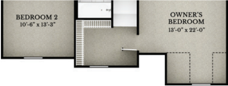
OPTIONAL AMERICAN FARMHOUSE ELEVATION