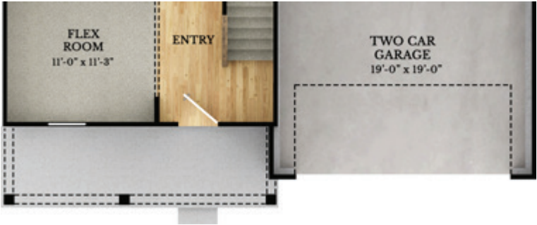
OPTIONAL AMERICAN FARMHOUSE ELEVATION