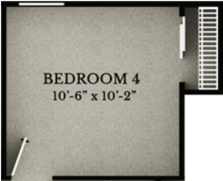
OPTIONAL BEDROOM 4