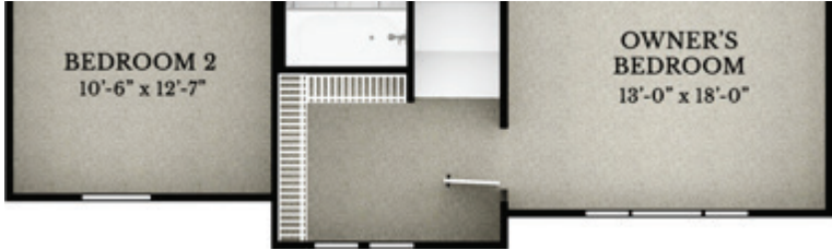
OPTIONAL CRAFTSMAN ELEVATION

1,891+ SQ. FT. • 3 BED • 2.5 BATH • 2-CAR GARAGE