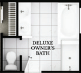
OPTIONAL DELUXE OWNER'S BATHROOM