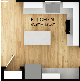
OPTIONAL KITCHEN ISLAND